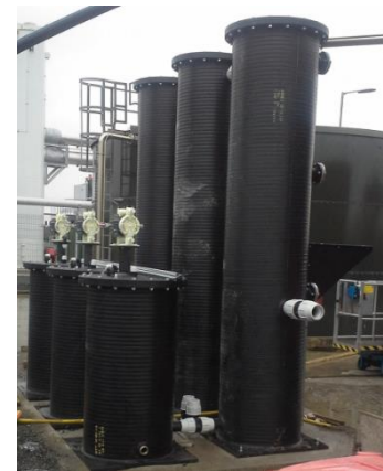
Figure 1 - CrumRubber Pilot Plant

As part of an extensive research program in the early 2000's to develop a catalytic roughing filter for H 2 S removal Bord na Mona identified Crumb Rubber as an ideal media with the capability to catalytically remove and convert H 2 S to sulphate. The Sulphate deposited on the surface of the crumb rubber media (origin of material waste automobile tyres). The media could be regenerated by continuous or intermittent flushing with water. Typical removal efficiencies for levels from 10 to 200 ppm of H 2 S ranged from 30 to 70 percent. Initial attempts to get the media to operate as a support media for biological treatment were not successful and this was attributed to the hydrophobic nature of the media. The concept was patented as a roughing process for reduction of H 2 S prior to biological filters. This allowed for reduced contact times and improved performance with the biological filter.