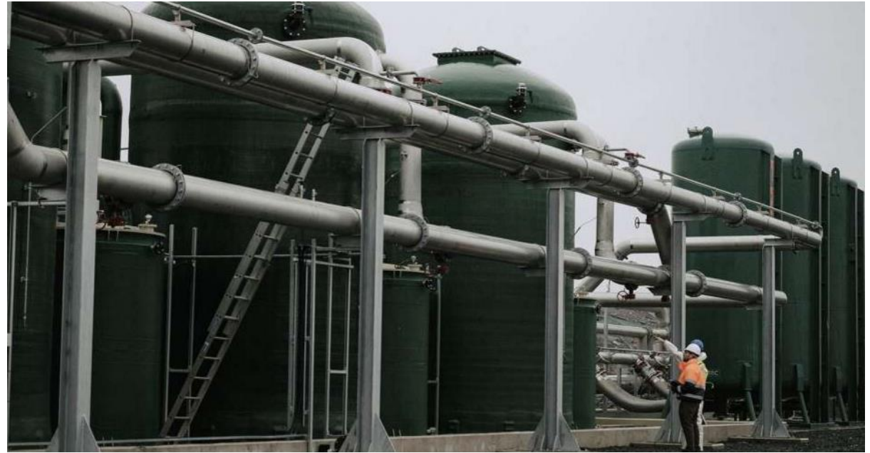
Figure 6 - CrumRubber Biogas Cleaning Plant

Anua Clean Air International Limited. Maynooth Works, NUIM, Maynooth, W23 F2H6 Co. Kildare, Ireland T: +353 45 579 783 W: www.anuacleanair.com